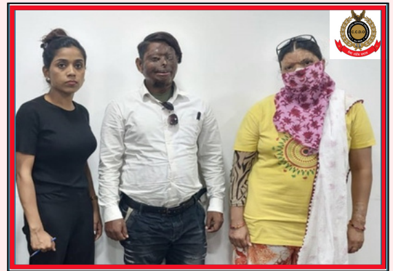
Met and assist acid attack victims