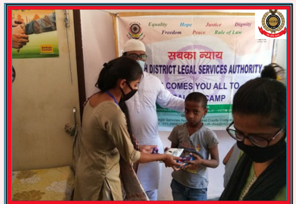
Initiated milk distribution drives for underprivileged communities in Delhi during the first wave of COVID-19

He changed my face, not my heart. He threw acid on my face, not on my dreams.