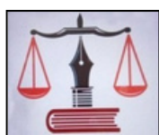
A.N. Associates Law firm